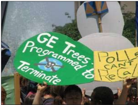
Many anti-GM protests are not about the science of genetic modification but about issues of corporate control, public involvement in new technologies, and ideologies based on defending nature from perceived harm.

Understanding these six key principles that govern public attitude outlined above shows that it is very difficult, if not meaningless, to derive a single statistic for consumer attitude towards GM foods, as any statistic will be related to many diverse factors. To obtain accurate data, a new poll would need to be conducted for every different type of GM food or crop under