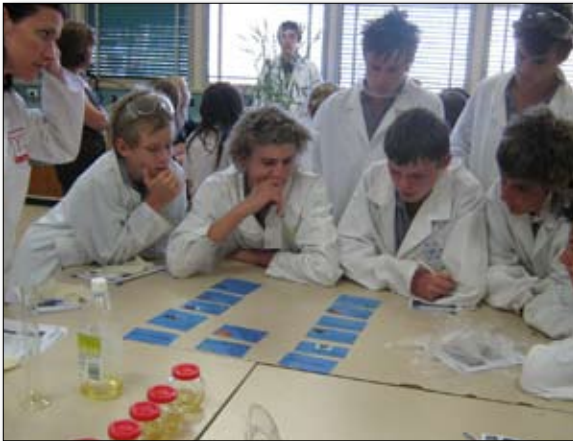
Get into Genes workshop for students to learn about gene technology, developed by the Australian Center for Plant Functional Genomics and the Molecular Plant Breeding Co-operative Research Center.

The Australian Government funded the development of Biotechnology Online, an internet-based teaching resource for high schools. It was developed by science teachers, for science teachers. The resource was supplemented